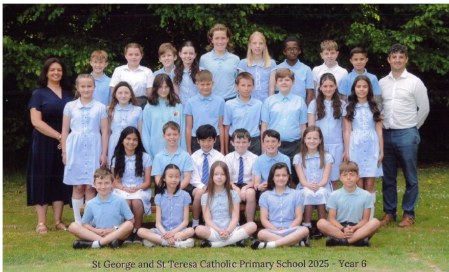
St George and St Teresa Catholic Primary School 2025 - Year 6

Of course, it's not just Year 6 who have been busy. All of the children had a fab time at our summer fayre. There have been lots of sporting and musical activities going on too.